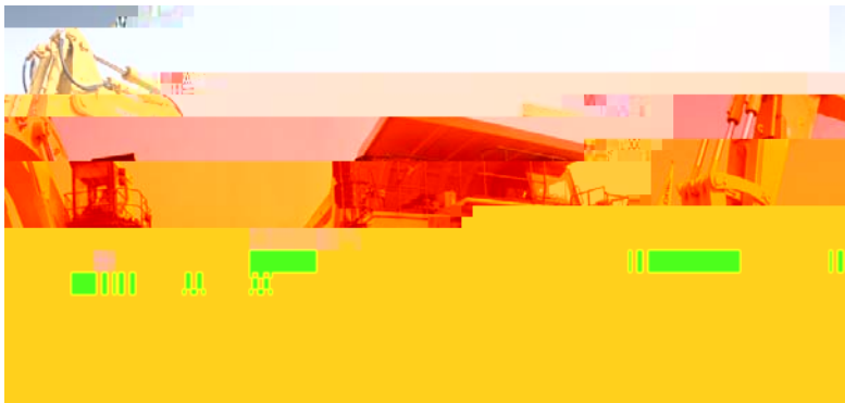
PC2000-8 Hydraulic Excavator and HD785-7 Rear Dump Truck displayed at L&T stall.

Other equipment on live display at L&T's stall were Komatsu HD785-7 Rear Dump Truck (100-tonne payload capacity) from Komatsu India Pvt. Ltd's Chennai Plant and Scania P380 Tipper – the popular 18.8 cu.m. capacity truck from Sweden. Besides, L&T showcased its product support capabilities for mining