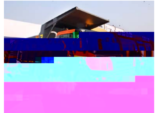
Side view of the stall: Scania P380 Tipper on display.